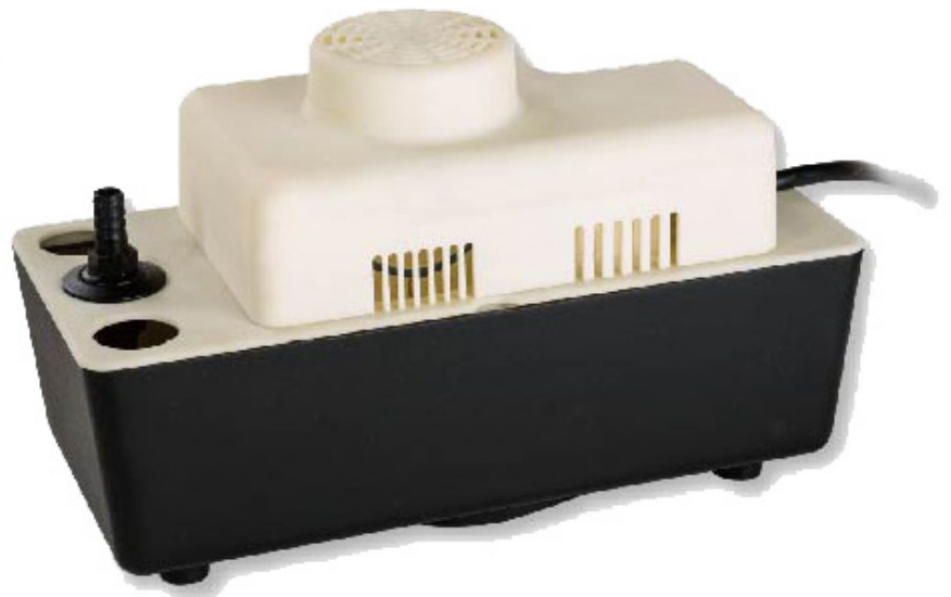
Model: RCPSS With Safety Switch Model: RCPWS Without Safety Switch

Optional safety switch for automatic shutoff to prevent flooding